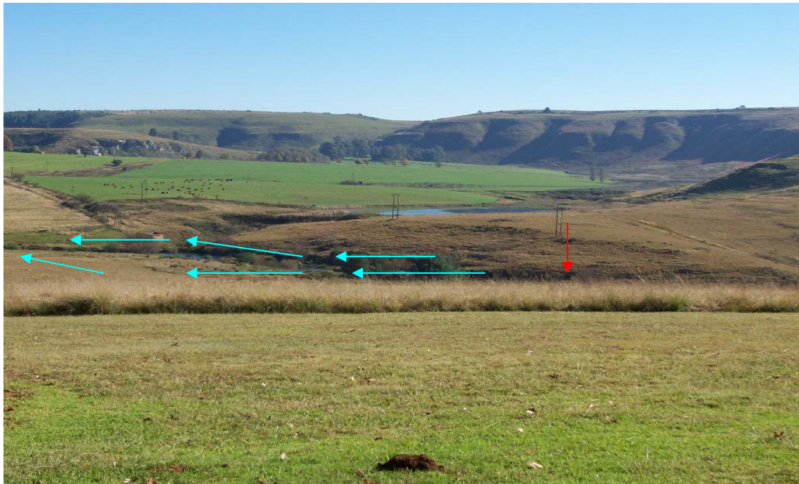
Fig 2. View of the affected site from the Coldstream house. The red arrow indicates the approximate position of the barrier. The turquoise arrows indicate the direction of inundation. Note the close proximity of the neighbouring impoundment.