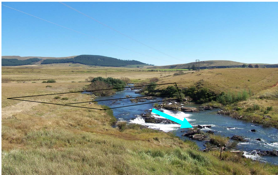
Fig 1. A view of the site looking up river from an elevated point. The typical view of the proposed development using lines indicate the general area where the barrier is set to be placed. The turquoise arrow indicates the direction of flow.

The above mentioned assessments were carried out during a single site visit on the 28 th of April 2006. Information provided by Nemaï Consulting included a background information document. Mrs J. Clements provided minutes of the dedicated stakeholders meeting including the slide shows presented.