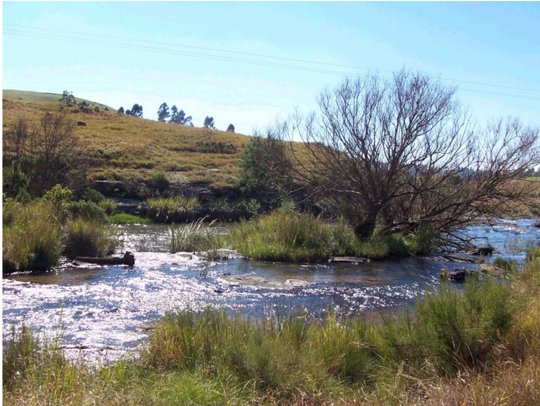
Fig 4. The secondary stream where the SASS sample was taken (S 29°20'40.4" E 029°53'42.7")

used to be abundant in all inland streams and rivers of Natal, but has been heavily preyed upon by trout and is now scarce in certain streams.