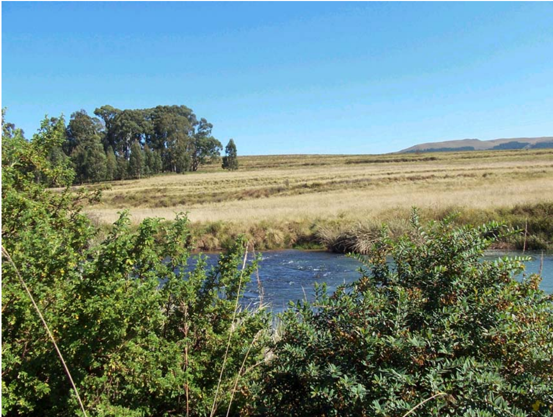
Fig 3. Shallow riffle habitat with deep water both upstream and downstream. Note the encroachment of riparian vegetation

precipitation the river breaches the main channel (J. Clements pers. comm.) to inundate a small flood plain (wetland area described in 3.1).